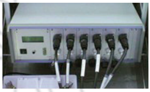
LLF-M with 6 signal channels