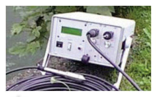
LLF-M with 2 signal channels